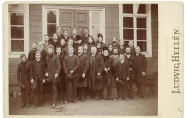
The Finnish Deaf Club was founded in 1886