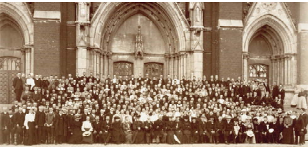
The third general meeting of the Deaf association in Finland in 1905. The Finnish Association of the Deaf was founded the same year.