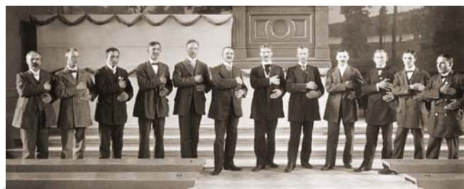
At a Nordic meeting of the Deaf in Stockholm in 1912, the Finnish Deaf group was signing the Finnish National Anthem Maamme" (Maamme means "the land")

For more information, surf the website http://www.kl-deaf.fi/