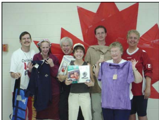
Door Prize Winners

Alberta Cultural Society of the Deaf hosted the fund-raising social, "I Love Canada" on May 31. The social was highlighted with red and white colors. The purpose of ACSD socials is to raise funds for various programs for the Deaf.