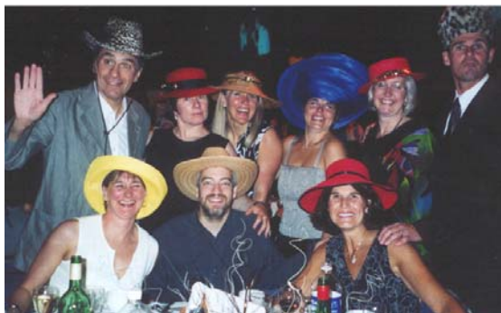
Many Hats! at Banquet/Gala